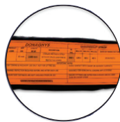
Traceable ID tag