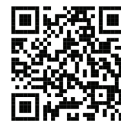
Destruct Test Video